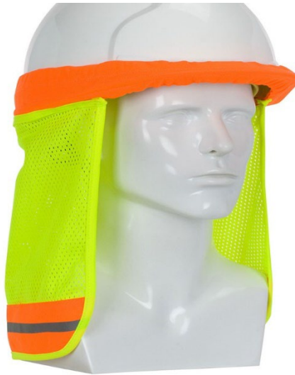
Item # 205101