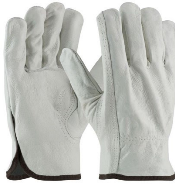
Item # 179105