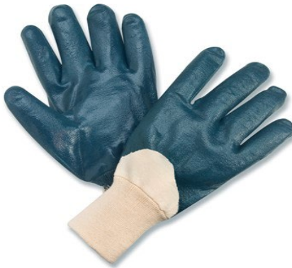
Item # 8514