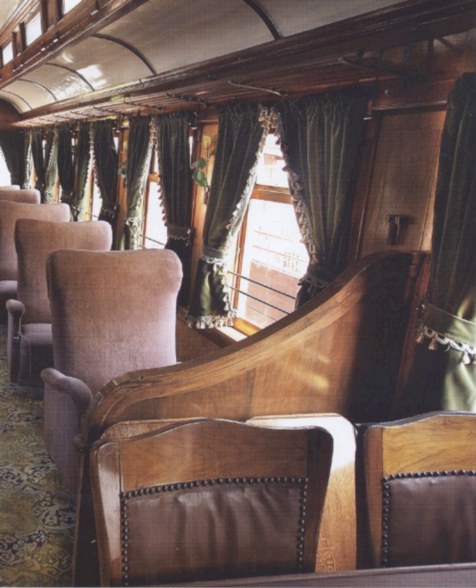
Looking at the back platform end of the Durango, the four-placed dinette is in the immediate foreground. The 10-seat parlor looks like a pretty cozy place to view the Rockies as this is the way the car was reconfigured in 1937 for service on the San Juan. The drumhead is still attached to the railing.

the purchase of D&RG No. 340, another Class C-19, and coach No. 310.